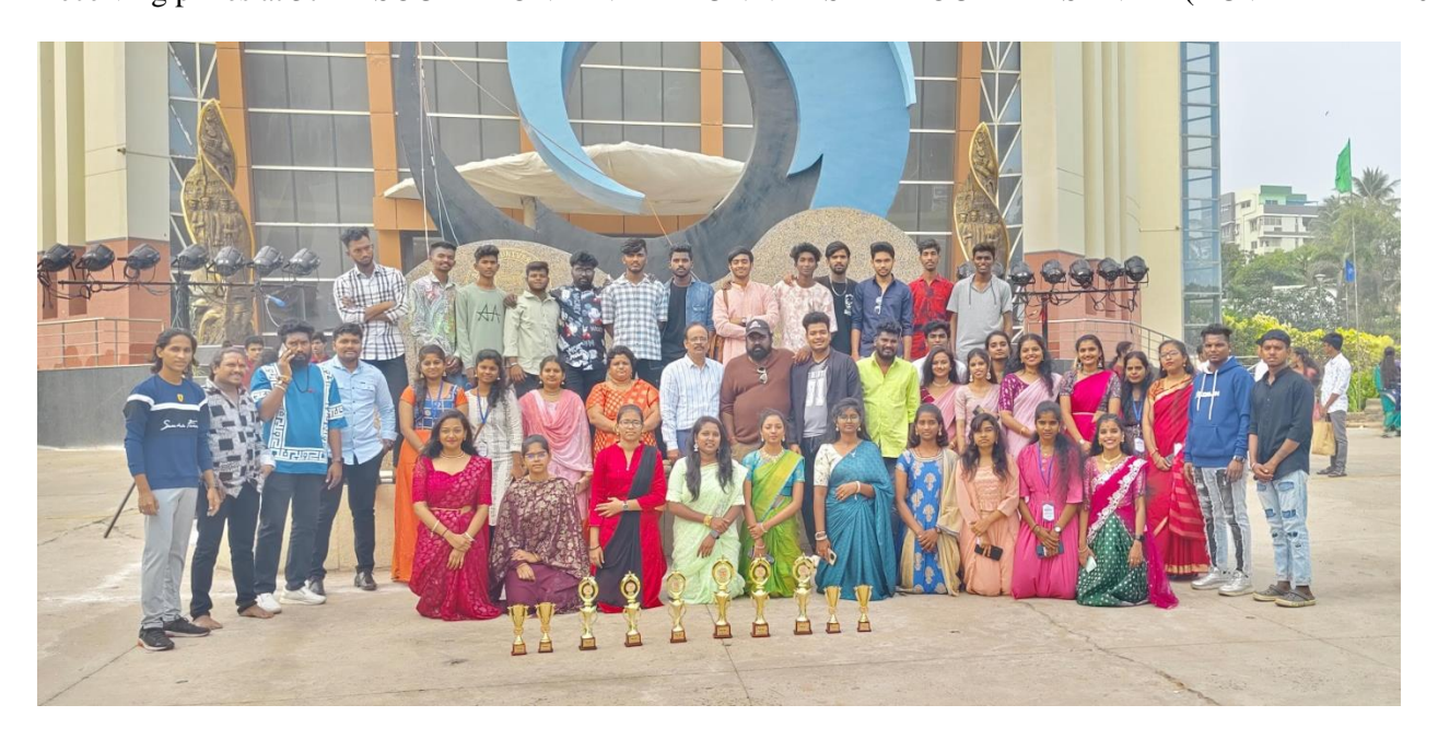
Group photo at 37TH SOUTH ZONE INTER - UNIVERSITY YOUTH FESTIVAL (YUVA BHERI 2023–2024)