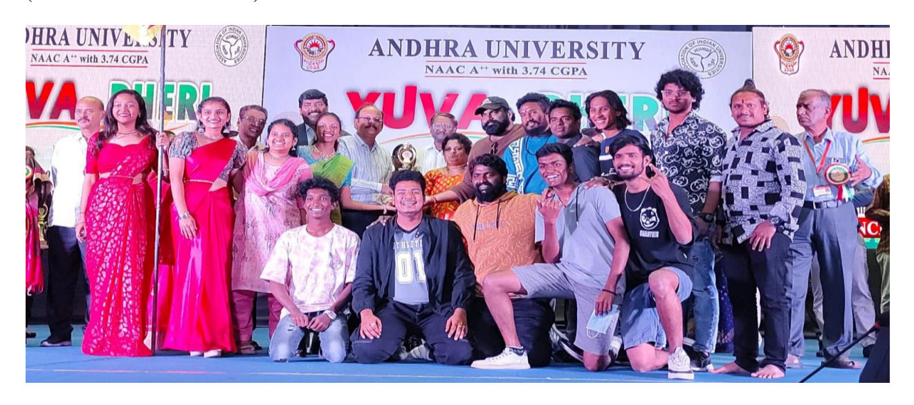
Receiving prizes at 37TH SOUTH ZONE INTER - UNIVERSITY YOUTH FESTIVAL (YUVA BHERI 2023–2024)

Performing folk dance (GANGA JATHARA) at 37TH SOUTH ZONE INTER - UNIVERSITY YOUTH FESTIVAL (YUVA BHERI 2023–2024)