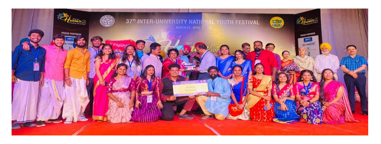
Receiving prizes in 37TH INTER - UNIVERSITY NATIONAL YOUTH FESTIVAL (HUNAR – 2024)