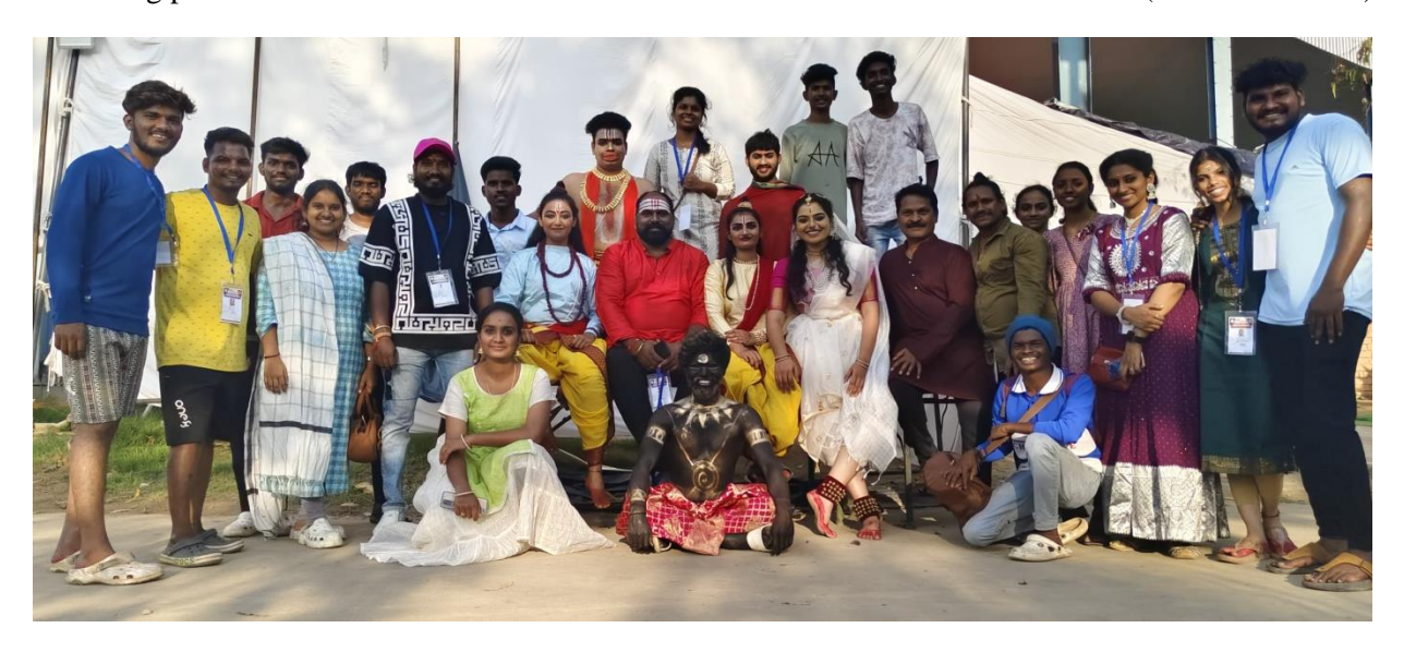
Group photo at 37TH INTER - UNIVERSITY NATIONAL YOUTH FESTIVAL (HUNAR – 2024)