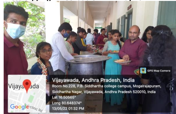
M.Sc.(CS) seniors students (2020-2021 Batch) offering lunch to their juniors (2021-2022) on the eve of Induction Program on 13 th May 2022.