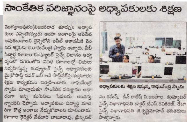
Press Clipping on Eenadu dated 30 th July 2022.