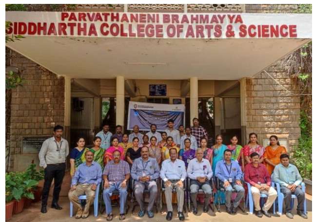
Group Photo of Participants on 29 th July 2022.